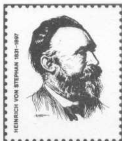
Heinrich von Stephan Deutschland 1831 - 1897