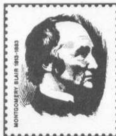
Montgomery Blair, USA 1813 - 1883

100 Jahre Weltpostverein Centenaire de l'Union postale universelle Centenario dell'Unione postale universale 1874 - 1974