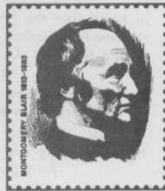
Montgomery Blair, USA 1813 - 1883

100 Jahre Weltpostverein Centenaire de l'Union postale universelle Centenario dell'Unione postale universale 1874 - 1974