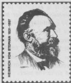
Heinrich von Stephan Deutschland 1831 - 1897